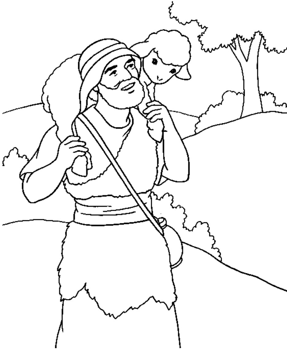
The Parable of the Lost Sheep